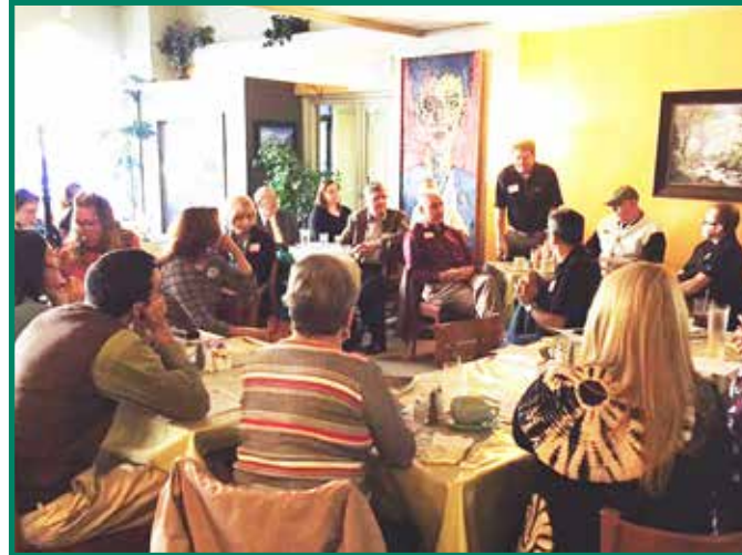
August 18th Leads Group South Leads South and Leads North meet every Thursday morning