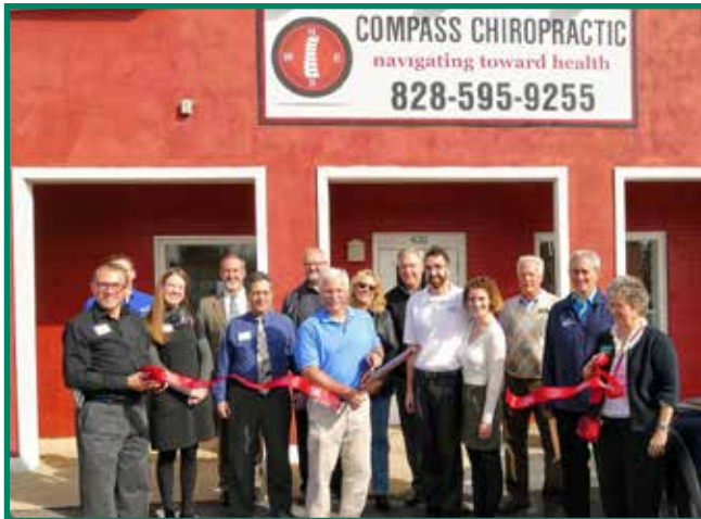
December 5th Ribbon Cutting at Blue Ridge Medical and Sports Massage One of over thirty ribbon cuttings in 2016