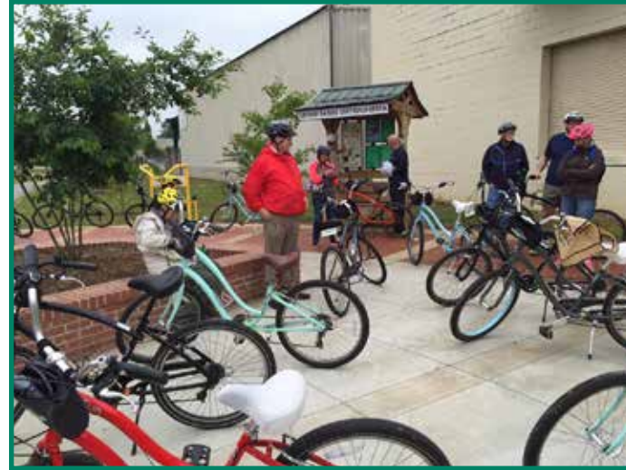
May 20th Swamp Rabbit Trail Community Development Trip