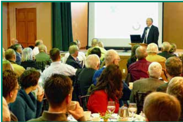
February 17th Economic Outlook Breakfast