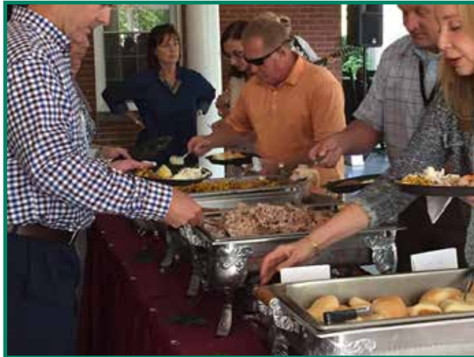
June 9th Industrial Division Pig Pickin'