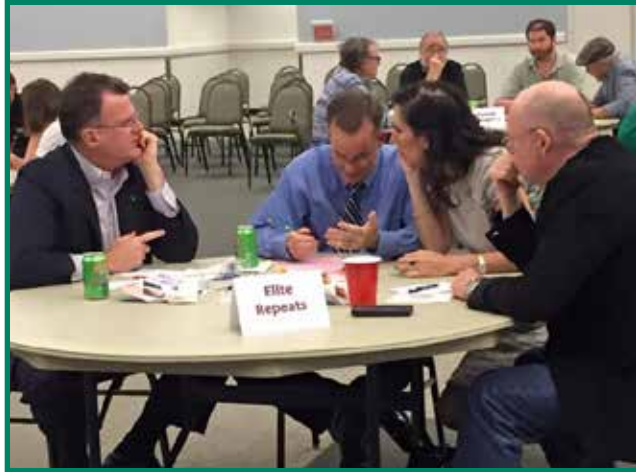
March 9th Chamber Trivia Challenge