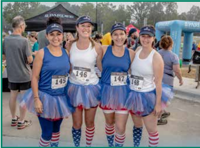
September 3rd Apple Festival 8K and 5K