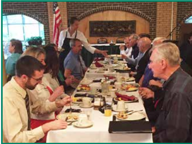
April 20th New Member Breakfast