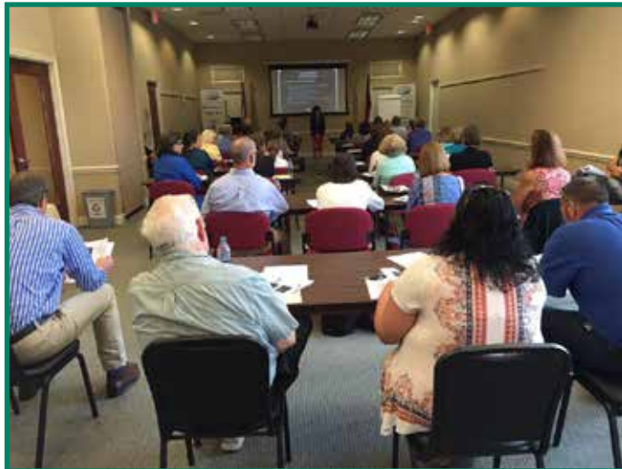
November 29th 2016 Employment Law Review