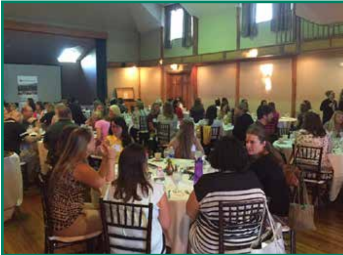
August 15th New Teacher's Breakfast