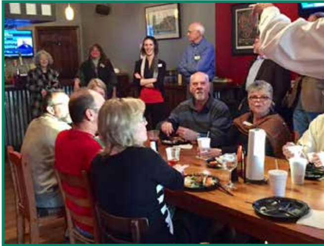
December 2nd Retirement Industry Group Holiday Social One of four Retirement Industry events in 2016