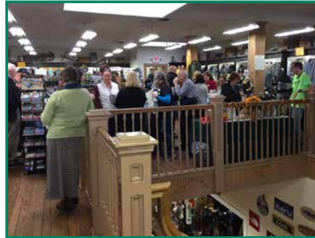
November 11th AM Power Hour at Mast General Store One of six AM Power Hour networking events in 2016