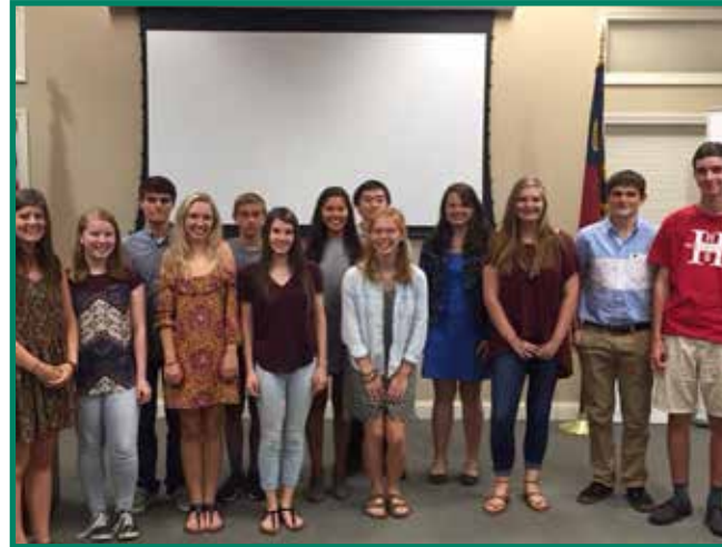
September 21st Junior Leadership Development Class Orientation