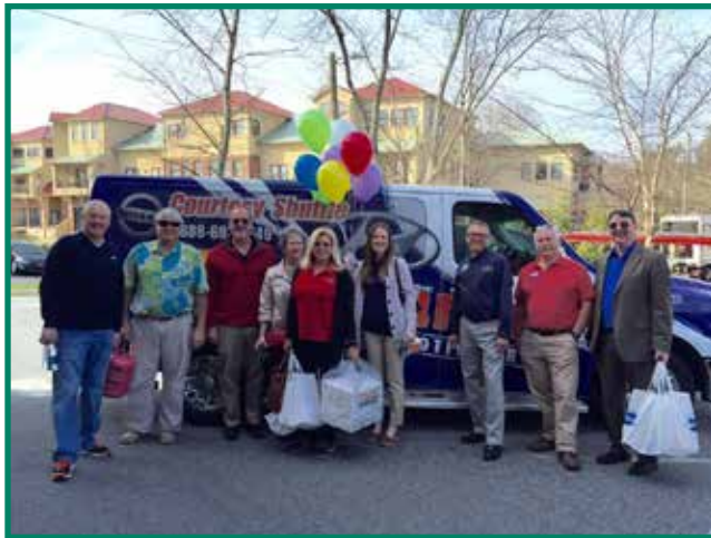
March 18th Ambassador Committee SurPrize Patrol One of four SurPrize Patrols in 2016