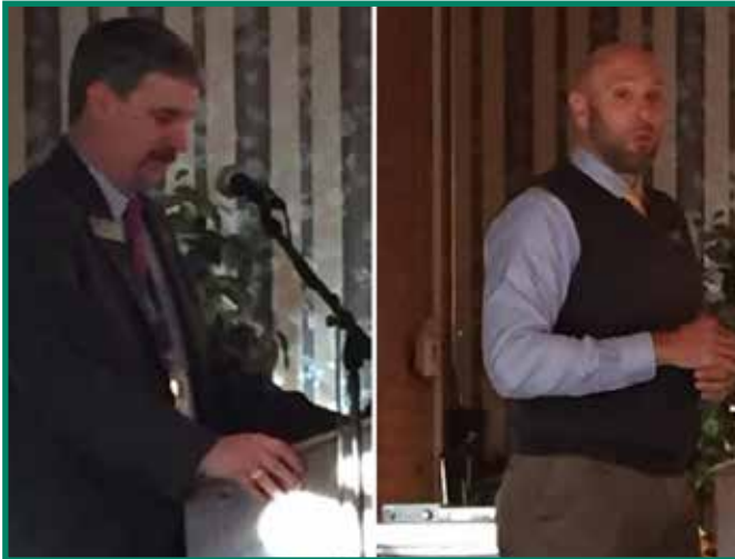
October 12th Business Morning Update Held the 2nd Wednesday of each month