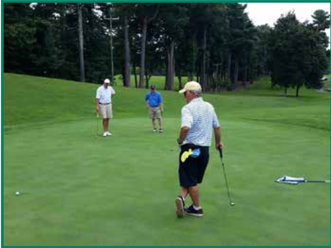
July 18th Chamber Golf Classic