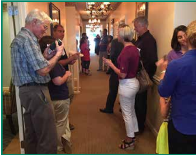
August 25th Business After Hours at Forest Lawn One of twelve Business After Hours networking events in 2016