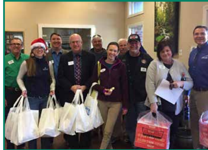
December 2nd Ambassador Committee SurPrize Patrol One of four SurPrize Patrols in 2016