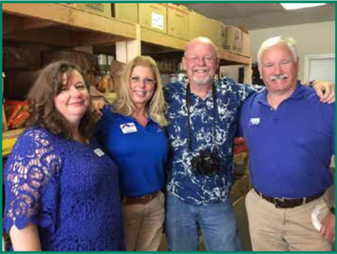
July 8th AM Power Hour at The Storehouse One of six AM Power Hour networking events in 2016