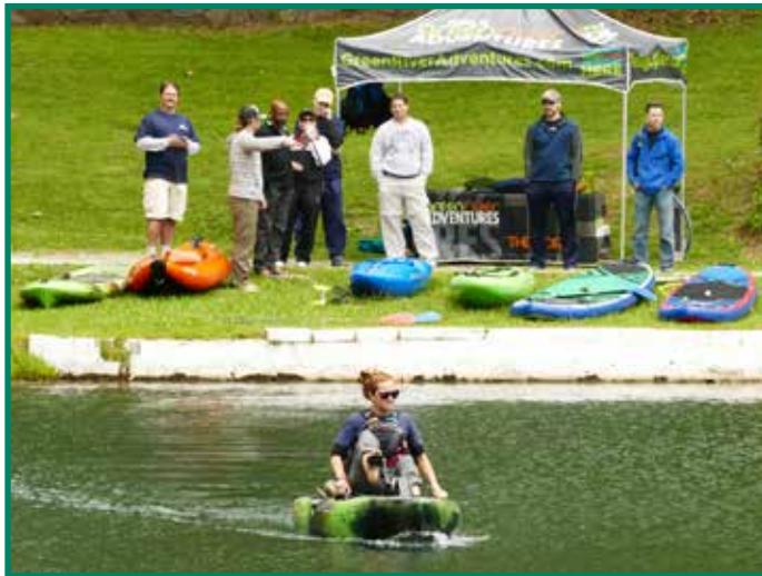
May 5th Camp Field Day